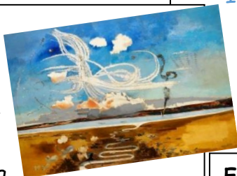
Battle of Britain seen here.

We will look at Blitz artwork, particularly focusing on the artist Paul Nash and perspective in drawing.